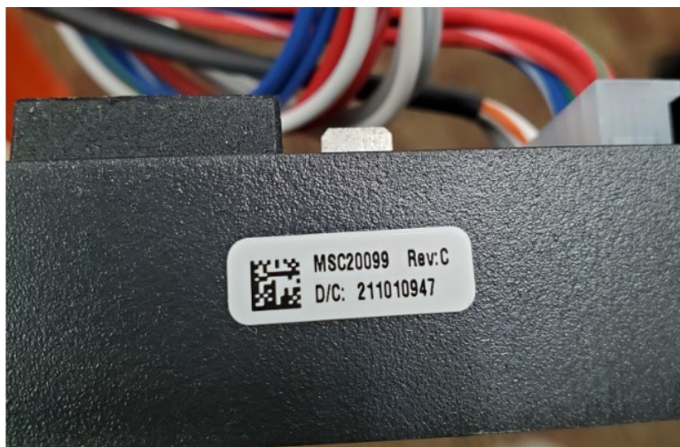
Figure 3 Module Part Number Decal

All Drag Pro plow boxes shipping from BOSS as of this bulletin will include either a REV B or C plow control module, both of which are compatible with the new REV B dual-programmable hand control.